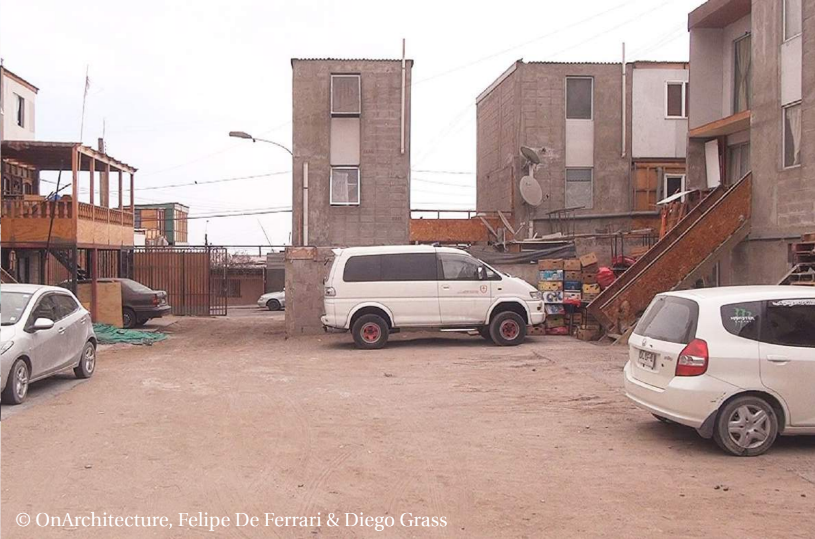
© OnArchitecture, Felipe De Ferrari & Diego Grass

on their capacity to articulate complexity in order to work collaboratively in the production of great spaces for everyone: not half-houses, but fantastic examples of architecture, with no social last name or conditions. And in order to do so, architects must organize themselves and struggle for their right not to be sentenced to design “good half-houses for low-income communities”, but just good houses! And then good houses that can become excellent examples for architectural history. As slaves of the capital and neoliberal ideology, architecture cannot advance much more than what Aravena has already done. That’s the limit of dignity under the neoliberal rule for social housing, which we need to break for the sake of both architecture, its inhabitants and our self-confidence as practitioners. That’s why the work of Aravena is more a pathway for starchitects to get social, rather than for people to get access to good architecture. The current state of Quinta Monroy exemplifies the failure of the “half-house” model as a mode for the production of architecture. Rather than bringing a revolution about, Elemental has adapted neoliberal means to social