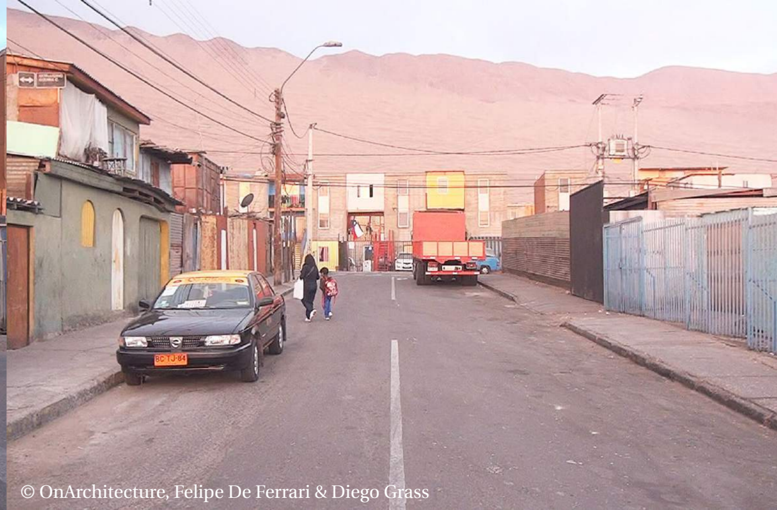
© OnArchitecture, Felipe De Ferrari & Diego Grass