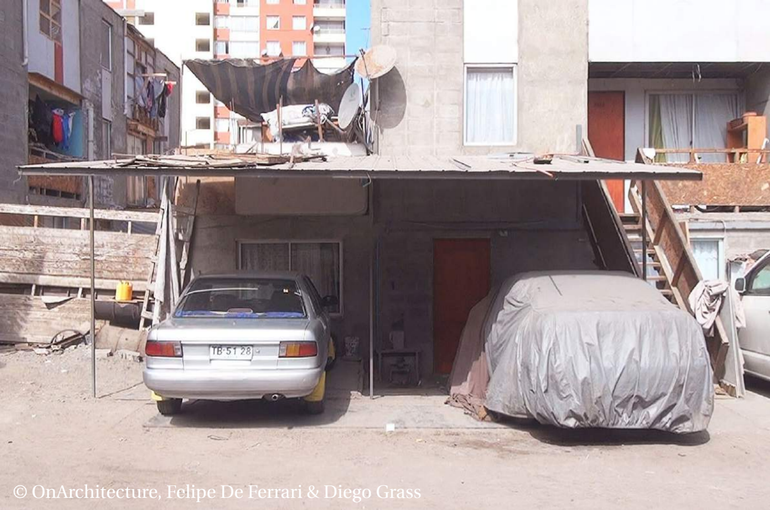
© OnArchitecture, Felipe De Ferrari & Diego Grass